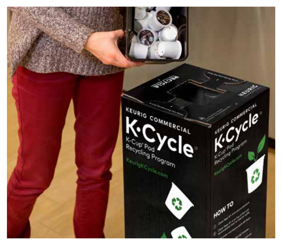
<sup>1</sup>2021 Program Reporting

That's why we're proud to offer the K-Cycle® Recycling Program. A simple way to make sure that every K-Cup® pod is fully recycled — giving all materials a second life and reducing waste. Since program inception, over 6 million pounds of material have been diverted from landfills!¹